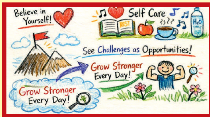
Creative by Grade VI

Resilient children learn to view challenges not as threats but as opportunities for growth and self-discovery. It is a mindset that develops gradually, built step by step through experiences, encouragement, and support.